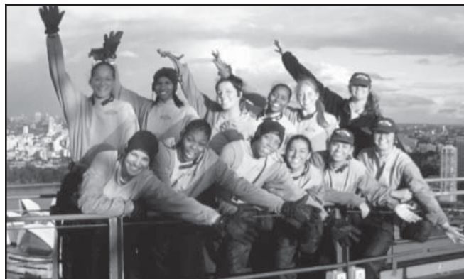
The Bruins as a team climbed to the top of the Sydney Harbour Bridge.

"The Harbour Bridge climb was super cool because we were a team about the situation. We were all hooked together by the railings, and that showed how we are one big team. If one person isn't in it, then we can't move forward. If one person stops, the rest of us can't move forward. That was really cool to see that we need every last person on the team."