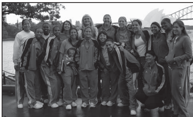
The Bruins' first stop was a scenic view of the Sydney Opera House and the Harbour Bridge.