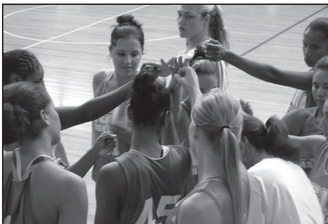
UCLA came together to win three games in the Australia tour.