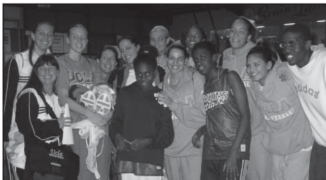
The Bruins meet the Bruins.