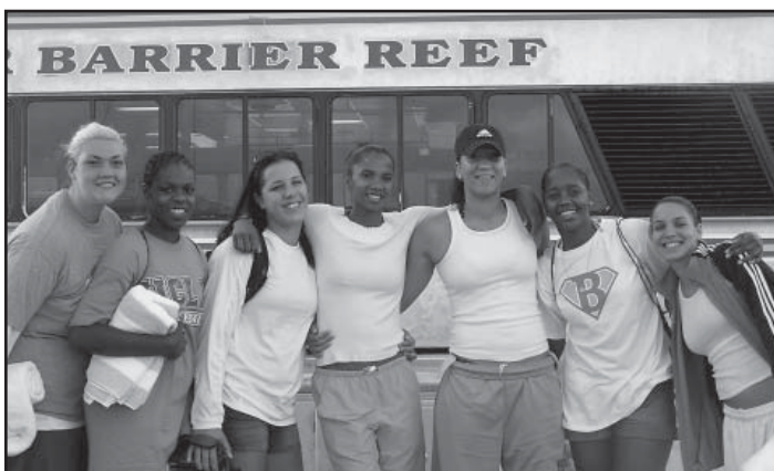
The Bruins set sail on a boat ride to the Great Barrier Reef.