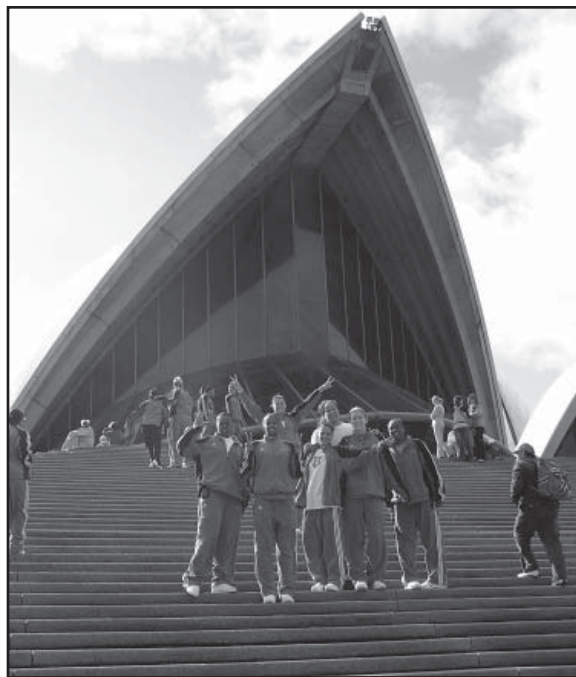
The Bruins pose at the steps of the Sydney Opera House.